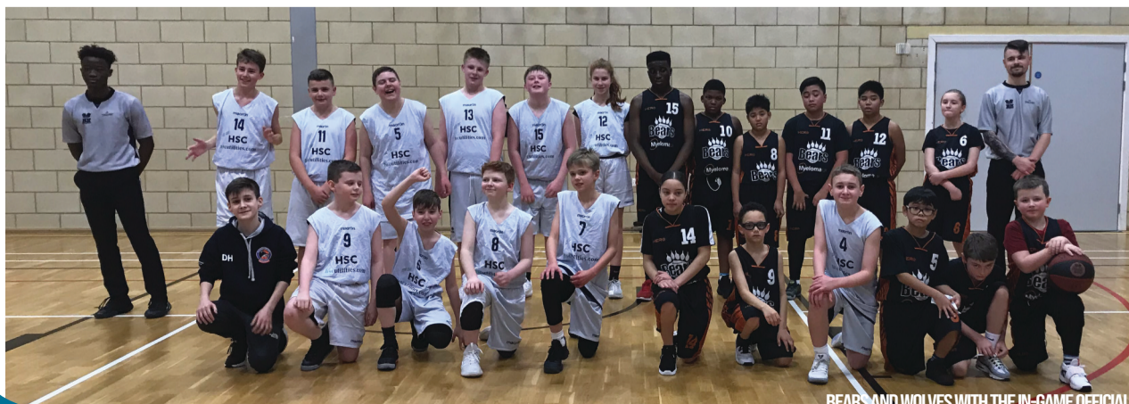
BEARS AND WOLVES WITH THE IN-GAME OFFICIALS